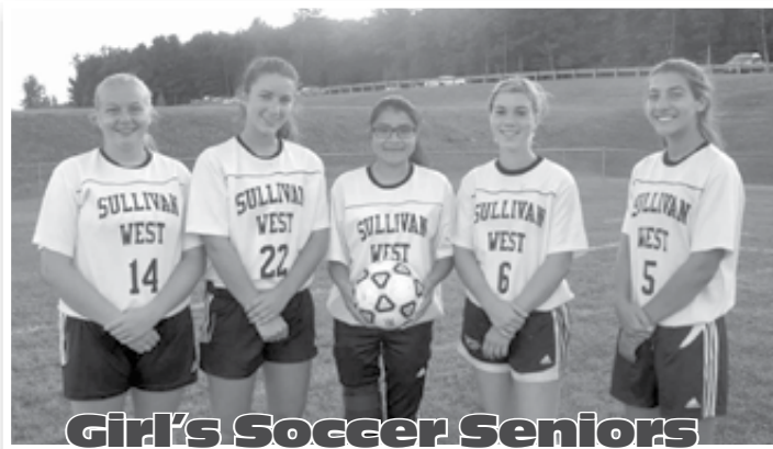
Girl's Soccer Seniors