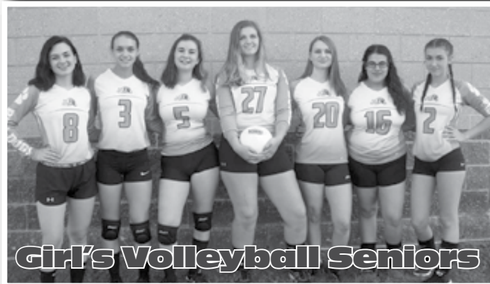
Girl's Volleyball Seniors