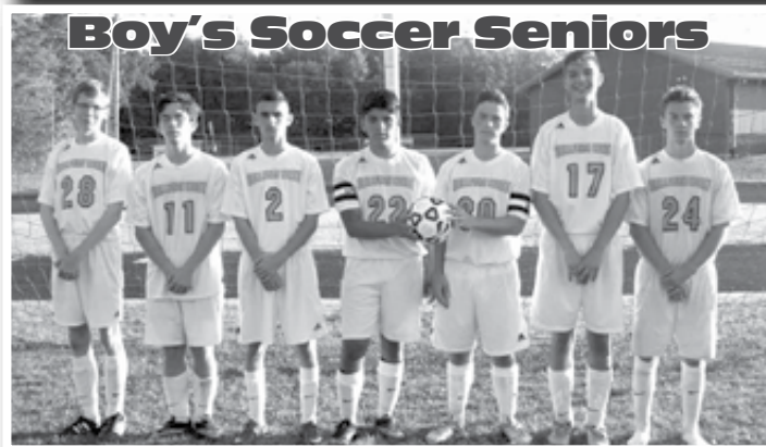
Boy's Soccer Seniors